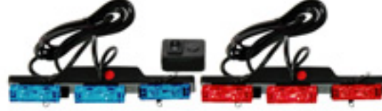
Emergency Warning Grill Light (LED)