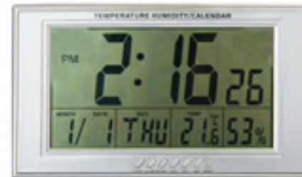
Digital Clock (Wall Type)