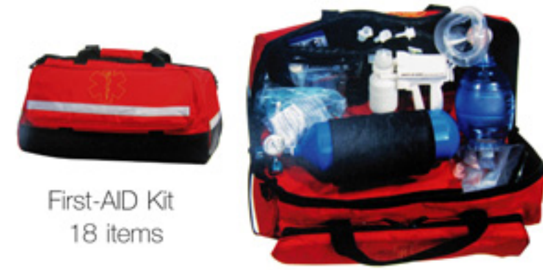
First-AID Kit 18 items