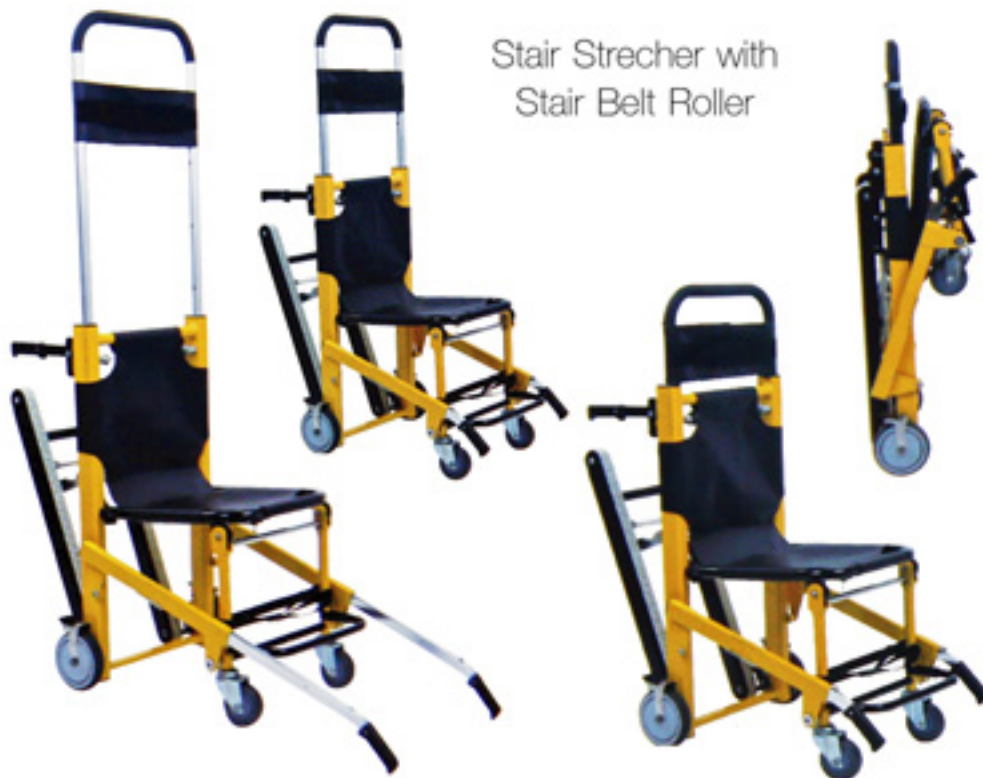
Stair Stretcher with Stair Belt Roller