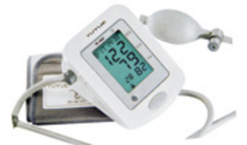
Digital Blood Pressure Monitor