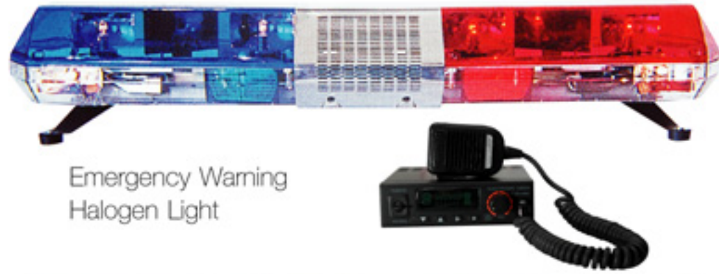
Emergency Warning Halogen Light