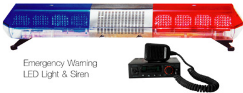
Emergency Warning LED Light & Siren