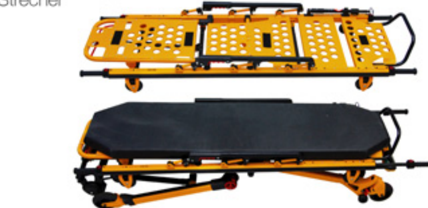
Stainless Steel Trolley Stretcher