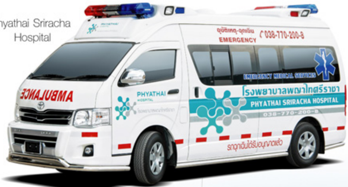
Phyathai Sriracha Hospital