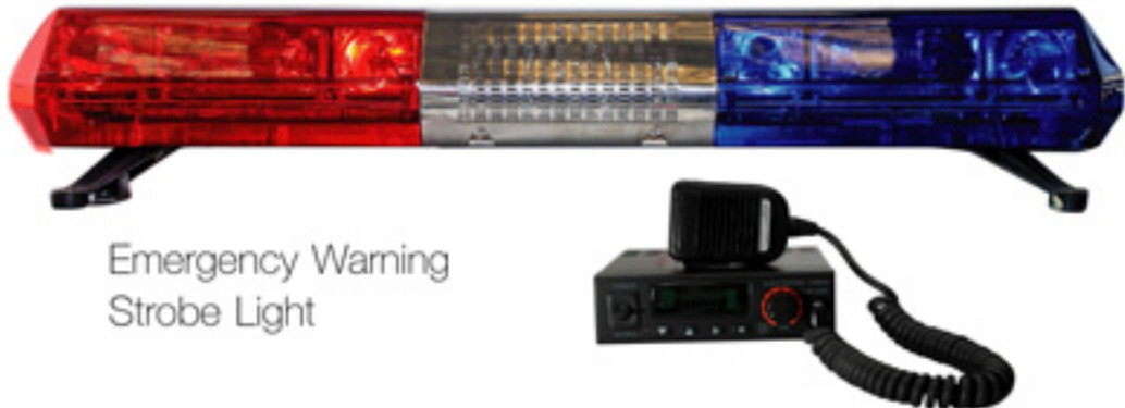
Emergency Warning Strobe Light