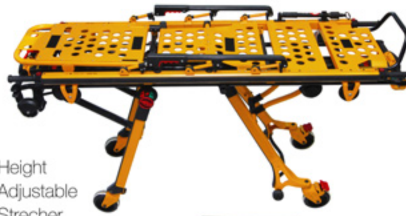
Height Adjustable Stretcher