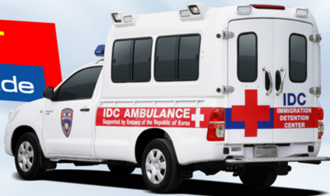
Embassy of the Republic of Korea