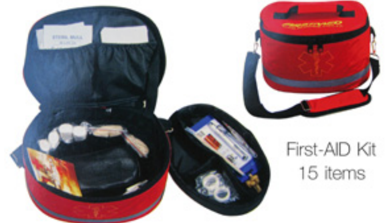
First-AID Kit 15 items